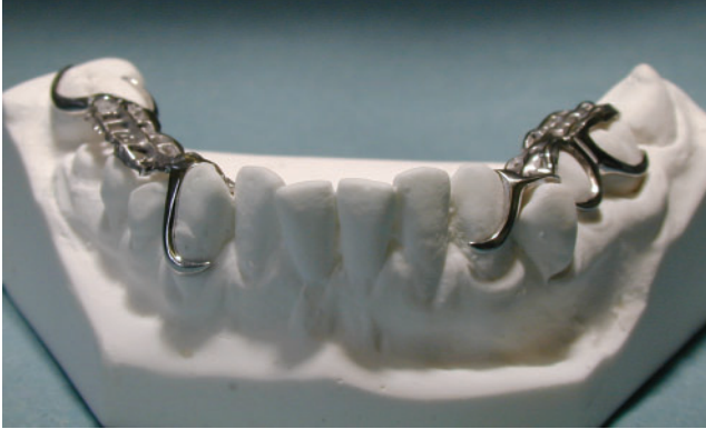
Figure 5 The chrome skeleton meshwork is kept clear of the occlusal surfaces to allow acrylic flow and keying