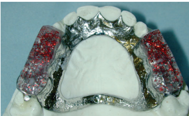
Figure 6 Completed maxillary chrome skeleton. The colour helps patient identification

The use of chrome cobalt-based mandibular advancement appliances may provide an alternative in the appliance armamentarium for managing snoring and OSA. The established benefits of chrome cobalt in prosthodontic dentistry are readily transferred to this application. Features of cast metal may be used to enhance retention, stability and patient acceptance. Chrome cobalt is generally thought to be kinder to the mucosal tissues than acrylic when in situ for a prolonged time. Its strength in thin sections allows the construction of less bulky appliances, which may be preferred by patients. The possible disadvantages of this approach are the financial cost, dependence on a chrome cobalt casting laboratory, and the additional clinical and laboratory stages. However, these disadvantages may be outweighed by the possible benefits of patient tolerance and appliance durability. Patients once accustomed to their appliances may avoid the inconvenience