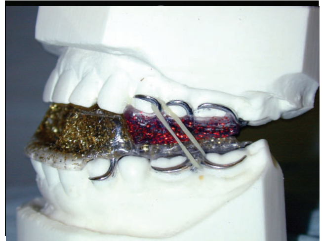
Figure 3 An upper chrome cobalt skeleton showing mesially approaching clasps on the upper cuspid teeth, occlusal cover and rests in the buccal segments

conventional acrylic/stainless MAA previously used. During 26 months of use and 36 patients treated, no appliance breakages were reported. To a limited extent, the heat-cured acrylic can be adjusted without the need to alter the chrome cobalt base plates. In situations where vertical bite opening needs to be kept to a minimum, the height of the lower bite blocks can be maintained by extending the acrylic blocks into the palatal area as viewed from the lingual aspect in (Figure 7). This modification acts as a further means of maintaining a forward postured jaw without excessive vertical opening of the mouth (Ben Stark, personal communication).