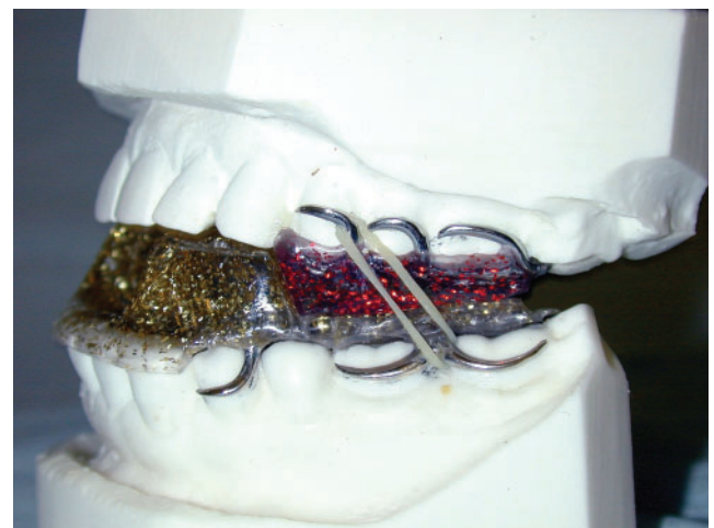
Figure 4 Completed chrome cobalt mandibular advancement appliance showing class two elastics to reinforce forward posturing and jaw closure

conventional acrylic/stainless MAA previously used. During 26 months of use and 36 patients treated, no appliance breakages were reported. To a limited extent, the heat-cured acrylic can be adjusted without the need to alter the chrome cobalt base plates. In situations where vertical bite opening needs to be kept to a minimum, the height of the lower bite blocks can be maintained by extending the acrylic blocks into the palatal area as viewed from the lingual aspect in (Figure 7). This modification acts as a further means of maintaining a forward postured jaw without excessive vertical opening of the mouth (Ben Stark, personal communication).